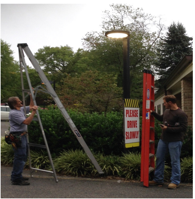
The lights were manufactured by SimplyLEDs located in Idaho and installed by Nugent Electric.